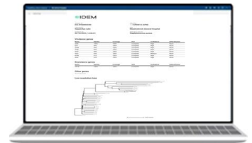
Summary information for IPC/clinical teams and patient records